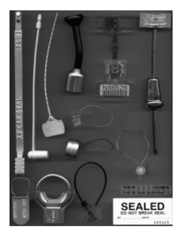
Figure 1: Examples of some commercial passive seals. Top row, left to right: a metal ribbon seal often used on railcars, two plastic strap seals, a bolt (barrier) seal, a plastic bolt seal, and a cable seal. The first 3 seals are open; to close them, one end is inserted into the other. Center: three wire loop seals, including the "e-cup" (left-most of the three) traditionally used in nuclear applications. Bottom row, left to right: two "padlock" seals (which despite the name are seals, not locks), a passive fiber optic seal, and two adhesive label seals.

passive fiber optic seal and the two adhesive label seals are irreversible mechanical assemblies. When such a seal is closed, it "locks" in a manner similar to cable ties. At least in theory, these seals cannot then be opened without causing obvious damage. All the seals except the adhesive label seals are typically passed through a hasp before being closed. The loop size after the seal is closed can be adjustable or fixed, depending on the design. The adhesive label seals are frangible and are intended to become damaged when removed from a surface.